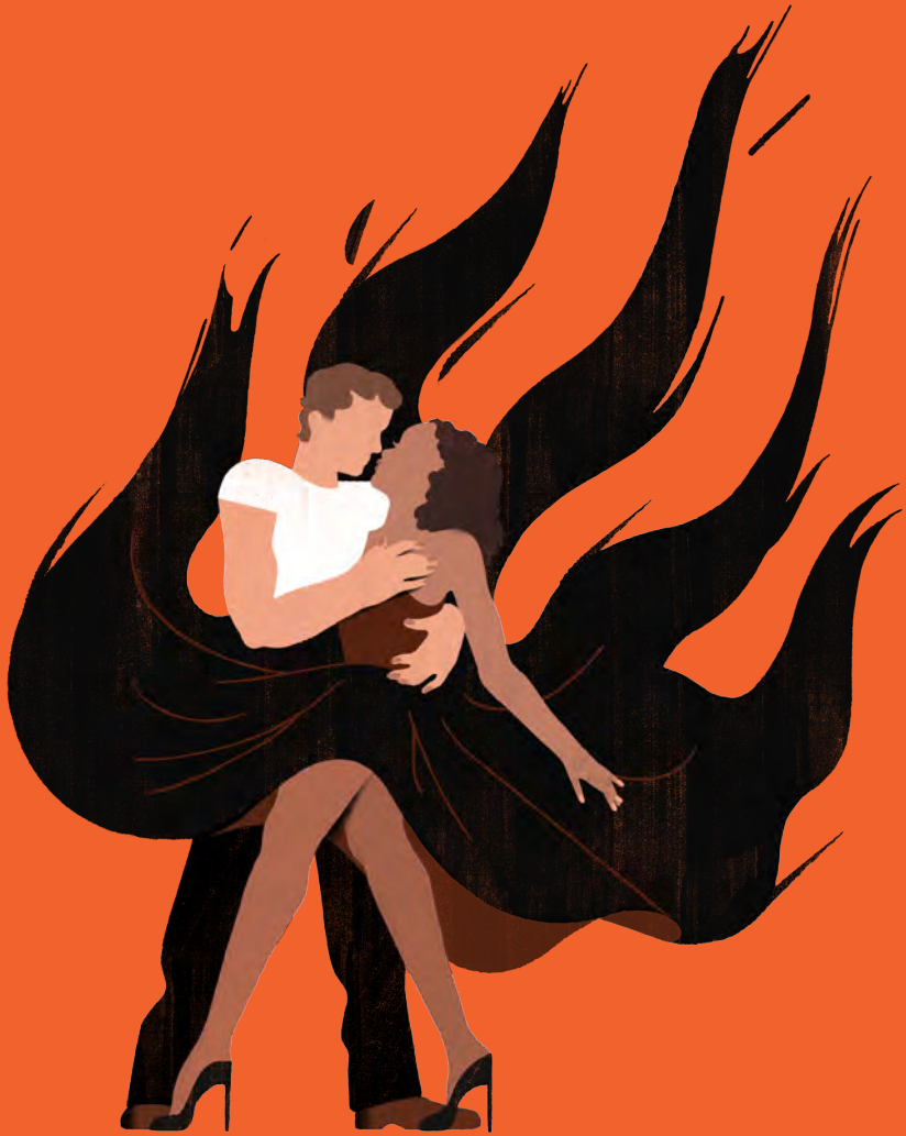
Illustration: Gracia Lam